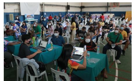
Employees and dependent follow minimum health protocols while waiting for their turn for the health assessment.

A second round of first dose of vaccination has been set in October of this year to ensure that TC Employees, Officers and their dependents are protected. It can also be recalled that in 2020, during the onset of the pandemic, Tagum Cooperative donated PPEs – gloves and masks, as an immediate response to the request of the City Government of Tagum.